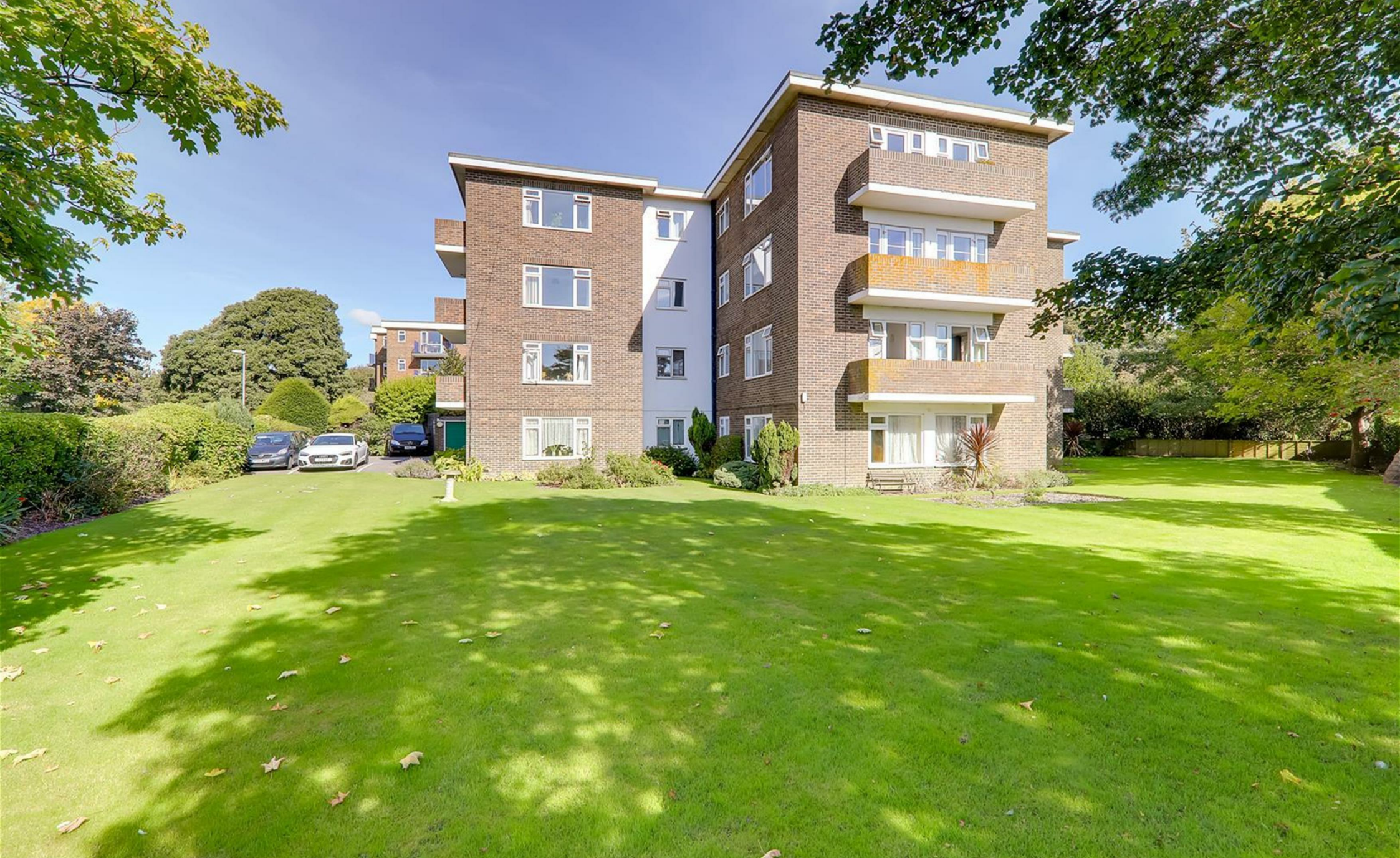
Queens Mansions, Worthing, BN11 3HX £1,250 PCM